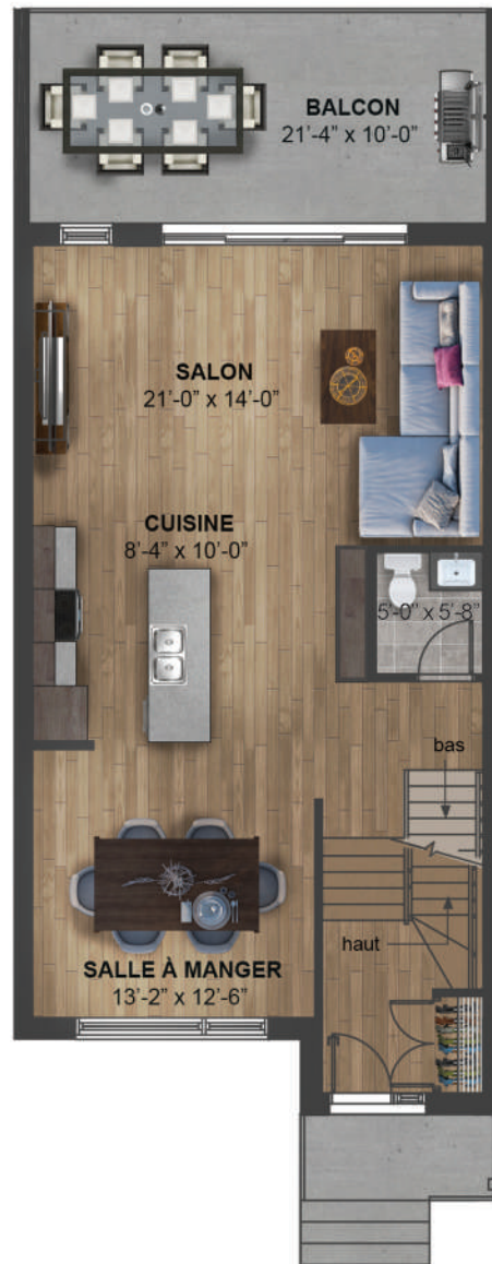
RDC CUISINE CENTRE ± 867 PI.CA.